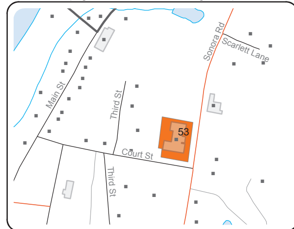
Sherbrooke (High-Crest Sherbrooke Nursing Home)

* Residents of High-Crest Sherbrooke Nursing Home, 53 Court Street, Sherbrooke, vote as constituents of the Municipality of the District of St Mary's Municipal Electoral District 7.