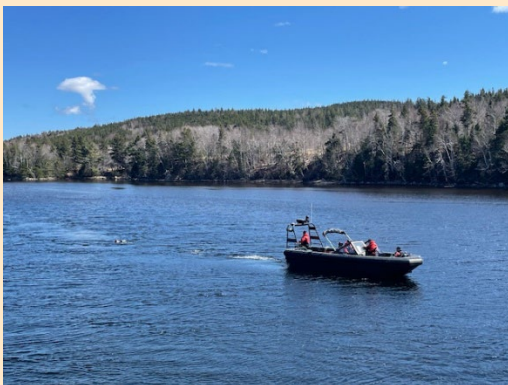
RCMP Underwater Recovery Team

Guysborough District RCMP continues to follow up on leads and review search information to related to this investigation.