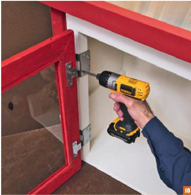
10. Add the door glazing and reinstall the door after finishing the structure.

Cut the two longer corner trims—for the left side of the structure—to length at 22\frac{5}{16} inches. Cut the two shorter corner trims—for the right side of the structure—to length at 19\frac{11}{16} inches. Glue the inside faces of each trim angle, position it on the box so it is flush with the top edges of the plywood panels, and fasten it through the side piece of the angle with three \frac{1}{4} -inch finish nails.