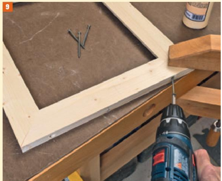
8. Glue the roof-trim angles to the roof deck and tack them in place with finish nails. 9. Fasten each miter joint of the doorframe with a 3" screw driven at a 45° angle.

Plan each cut before making it. Each trim piece is square-cut at the bottom end and miter-cut at the top end at 8 degrees. When installed, the 1-inch-wide piece of each L assembly fits against a side panel so that the joint between the trim boards is visible at the sides of the structure. It's helpful to position each piece on the structure and make a rough reference mark indicating the direction of the miter cut (photo 5).